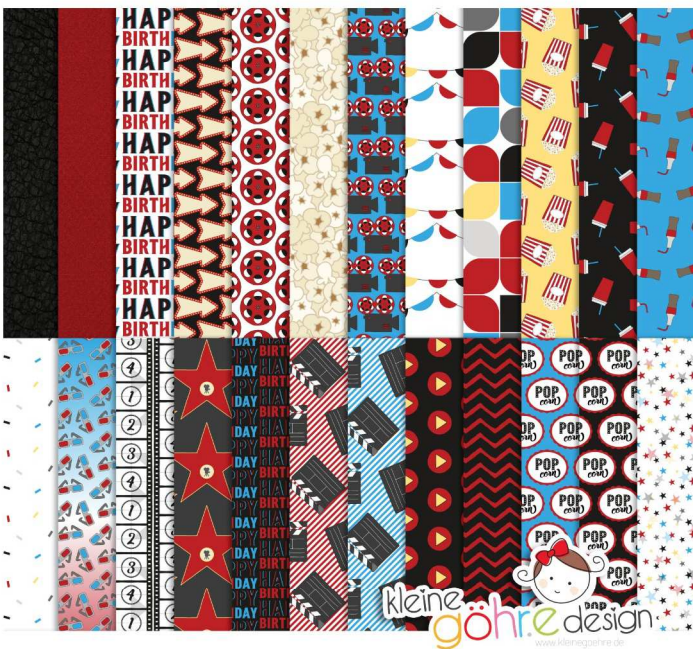
digitale Papiere "Kinotag Muster 1"