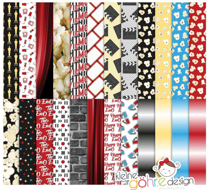
digitale Papiere "Kinotag Muster 2"