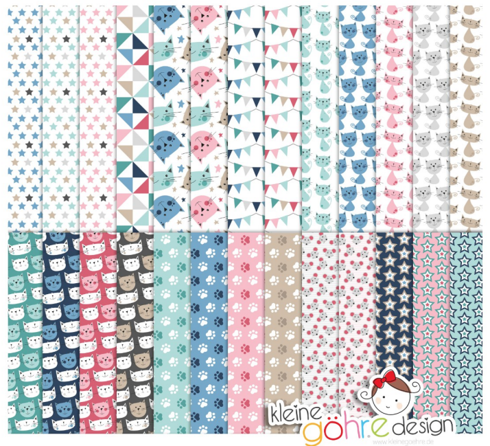
digitale Papiere "Katzentiebe Muster 1"