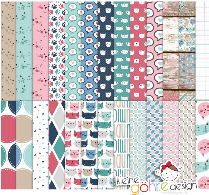
digitale Papiere "Katzentiebe Muster 2"