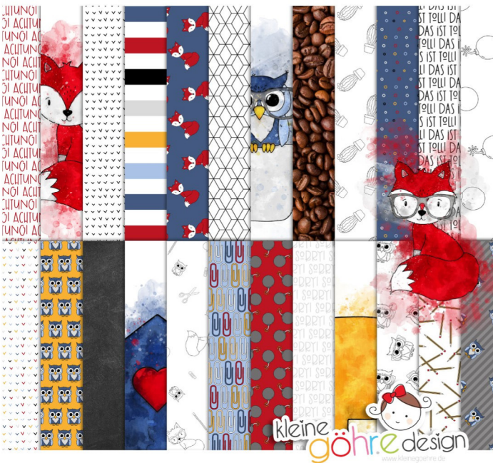
digitale Papiere "Home sweet Homeoffice Muster1"