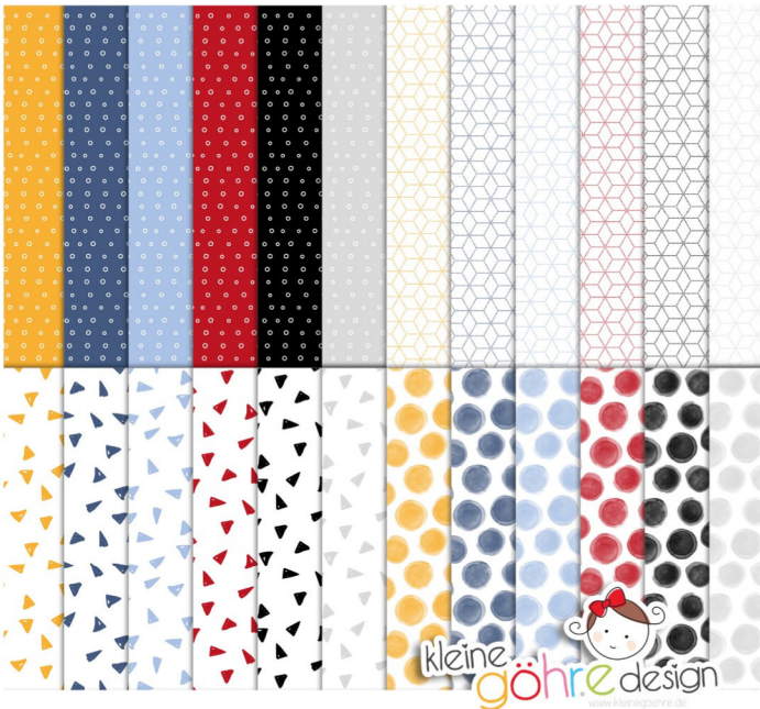
digitale Papiere "Home sweet Homeoffice Punkte&Co"