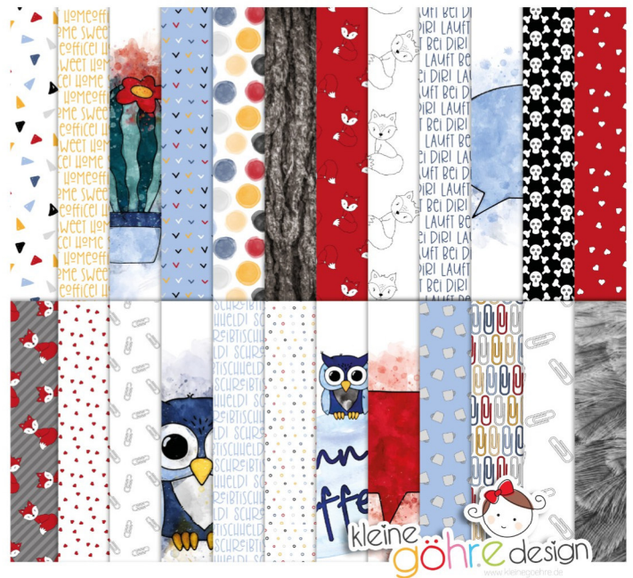
digitale Papiere "Home sweet Homeoffice Muster2"