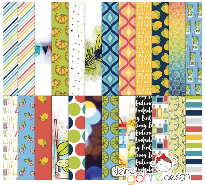
digitale Papiere "Gintastic Muster2"