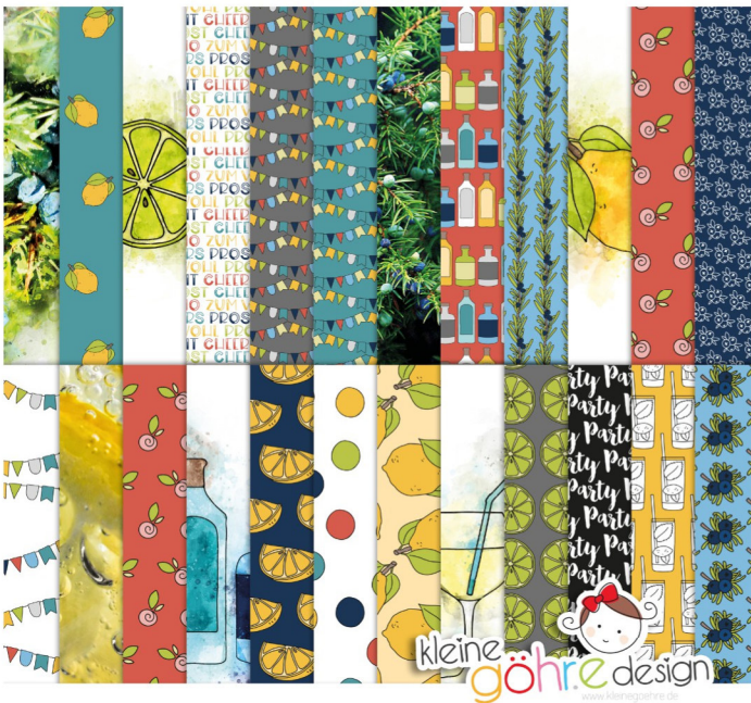
digitale Papiere "Gintastic Muster1"